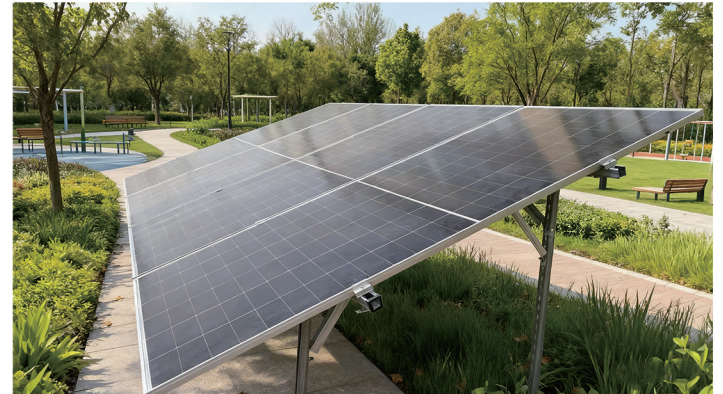
Public Green Spaces