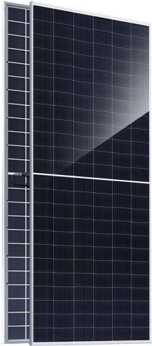
N-type double-glass PV module