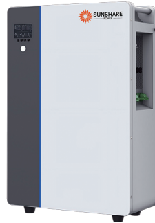
8kWh Integrated Storage System