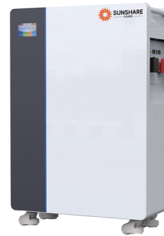
16kWh Residential ESS